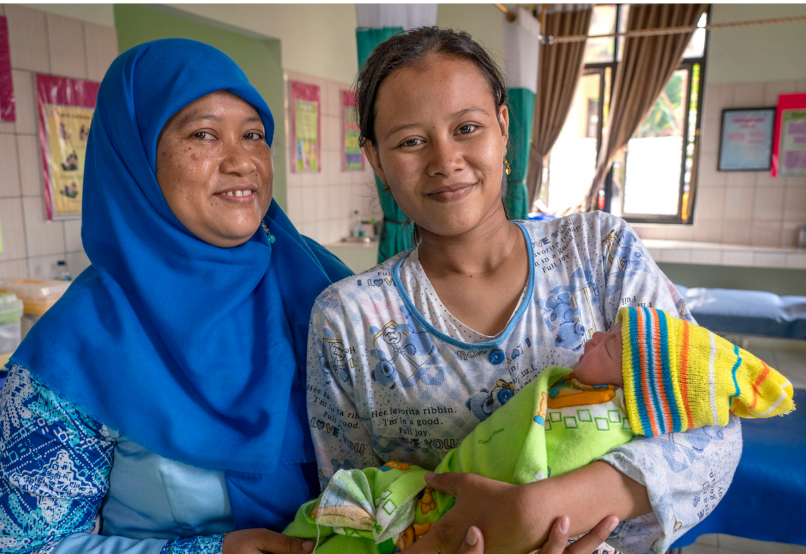
Above: A nurse in Banyumas, Indonesia, stands next to a new mother. In 2018, nurses in this birthing center completed a Helping Babies Breathe course run by LDS Charities facilitators.