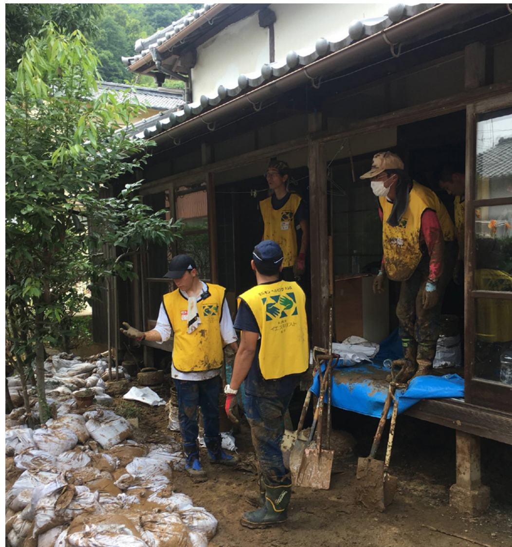
Top left and right: Helping Hands volunteers work to clear debris following flooding in southwestern Japan. Bottom left: Volunteers help move emergency food supplies to evacuation and volunteer centers.